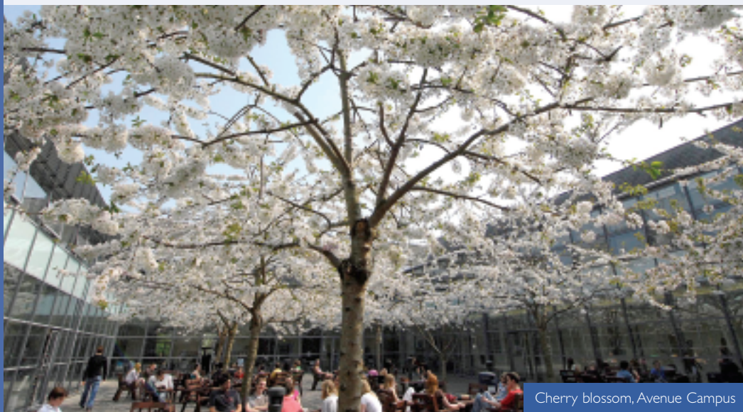
Cherry blossom, Avenue Campus